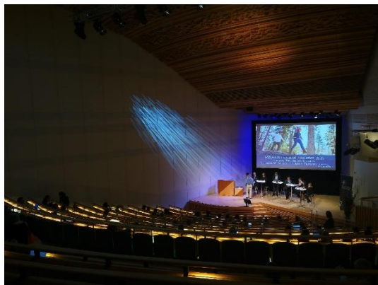
Aula Magna of Stockholm University