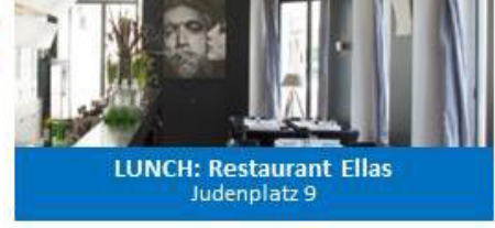
LUNCH: Restaurant Ellas Judenplatz 9