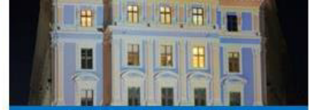
BANQUET: Bel Etage, Café Landtmann Oppolzergasse 6