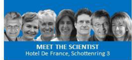
MEET THE SCIENTIST Hotel De France, Schottenring 3