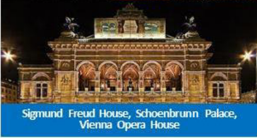
Sigmund Freud House, Schoenbrunn Palace, Vienna Opera House