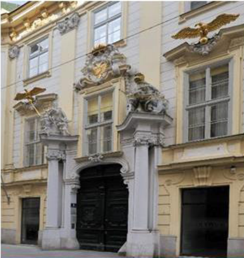
CONFERENCE: Old Town Hall Vienna Wipplinger Straße 6-8