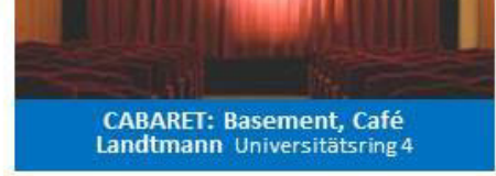
CABARET: Basement, Café Landtmann Universitätsring 4